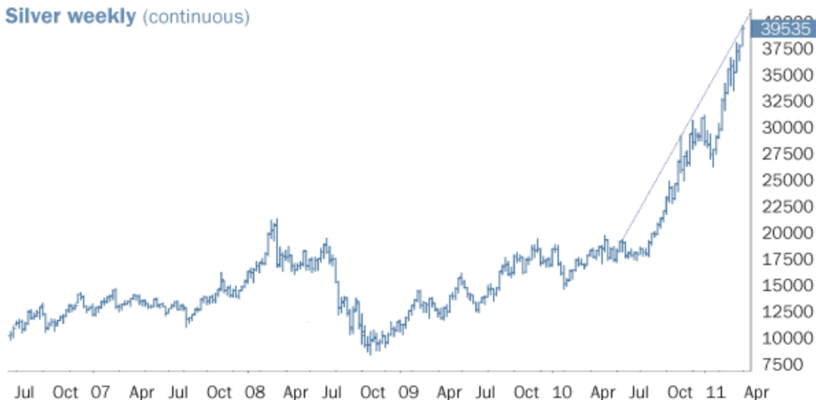
Silver weekly (continuous)

While gold was busy making headlines last year, silver recorded an impressive 82% gain for the year.